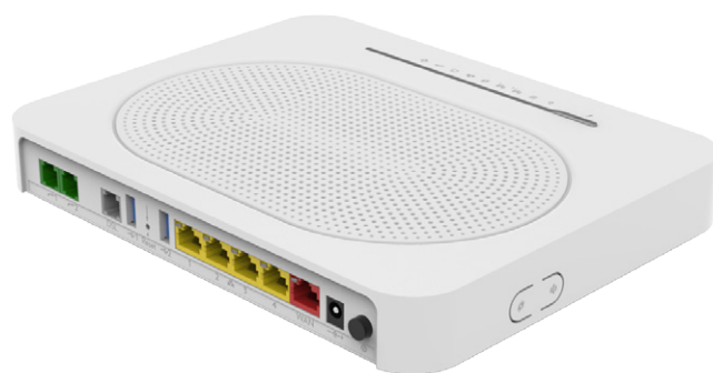
TG799TSvac Xstream back panel

TECHNICOLOR WORLDWIDE HEADQUARTERS 1-5, rue Jeanne d'Arc 92130 Issy-les-Moulineaux, France Tel: +33 (0)1 41 86 50 00 - Fax: +33 (0)1 41 86 58 59